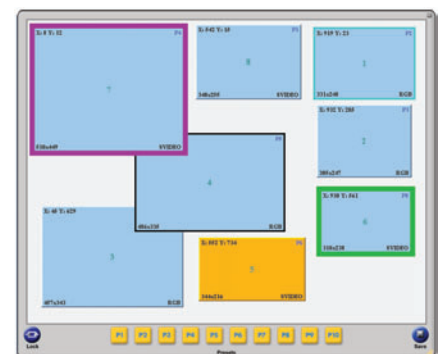
Remote operation via a web browser